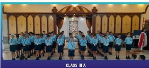
CLASS III A