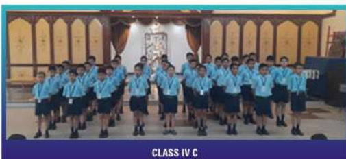
CLASS IV C