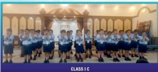
CLASS I C

The Inter - class elocution competition was held in the month of September. A wide variety of poets were heard with some delightful voice modulation and animated actions. The winners of each class received certificates and chocolates.