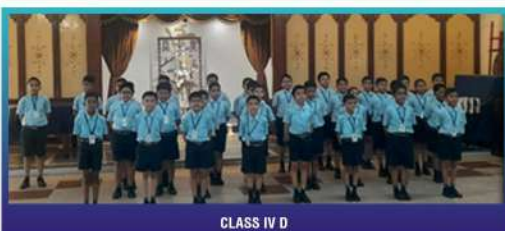
CLASS IV D