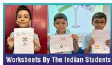
Worksheets By The Indian Students

Red hot kimchee is the most popular dish of South Korea!!