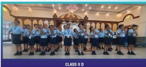
CLASS II D