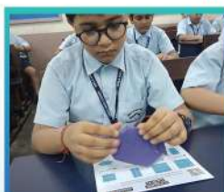
The Craft Of Paper Folding - Origami