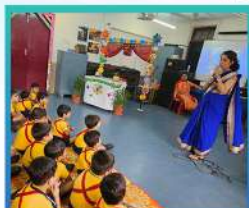
Let's Talk-motivational Session