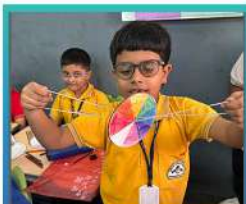
The Magic of Newton's Disc