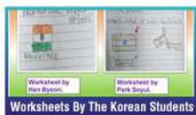
Worksheets By The Korean Students

The students of both the schools created worksheets and learnt many important anecdotes about each other's struggle to free their country from the clutches of Imperial rule.