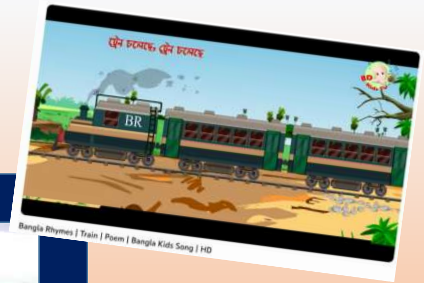
Bangla Rhymes | Train | Poem | Bangla Kids Song | HD